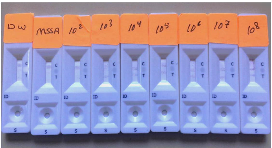
Figure 1: Immunochromotoghraphy test: Determination of the detection limit of ICT test strips.

In-vitro estimation of sensitivity and specificity of the ICT test strip: The detection limit of the ICT test strip was determined using S. aureus isolates suspended in PBS or DW at concentrations ranging from 10<sup>3</sup> to 10<sup>8</sup>CFU/mL. Visual analysis of the strips showed the appearance of positive T-line signal at 10<sup>3</sup> CFU/mL and greater (Figure: 1). All test strips showed strong positive signal at C-line, verifying that they were functioning correctly. The specificity of the ICT test strips was determined by positively detected MRSA isolates but didn't show development of signal with DW and MSSA species which was tested.