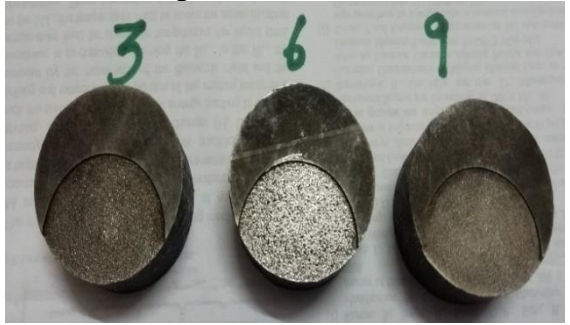
Fig 2: PMEDM (3, 6, 9) machined pieces

To compare PMEDM process with conventional EDM process, from the above table 1.1 three sample input parameters have been chosen 3,6,9. These input parameters are chosen because of it has +2 surface roughness value in difference.