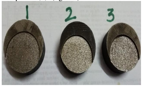
Fig 3: Conventional EDM machined pieces

The same Hardened specimen OHNS-O2 is machined with conventional EDM process for the input parameter shown in table 1.2, machined pieces of EDM are shown in fig 3, Surface roughness values obtained from these EDM pieces 1,2,3 (figure 3) are compared with surface roughness of PME-DM pieces 3,6,9 (figure 2) values.