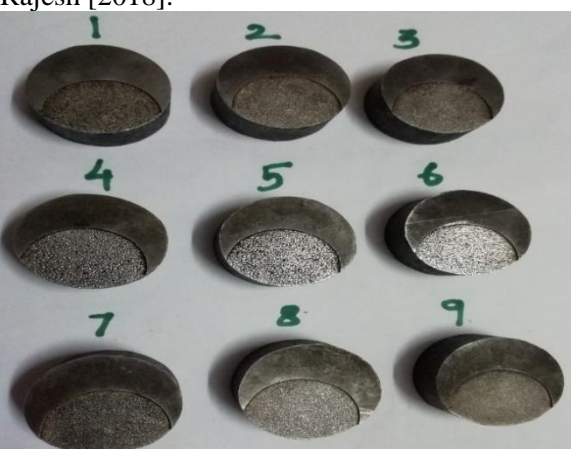
Fig 1: Machined 9 pieces of PMEDM

PMEDM process with work material OHNS-O2, size – 30 X 12mm, with Copper Electrode which has 20 dia X 15mm thickness. I POL Fluid is used as a Dielectric Fluid, Ampere Rate Min. Rate-2 amps, Max. Rate-20amps, in Machine Electronica PSR35, 9 pieces have been machined before, it is shown in fig 1 and the process was discussed in Rajesh [2018].