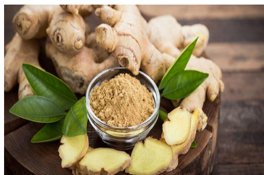
Fig. 2: Ginger

Ginger, the rhizome of the Zingiber officinale is commonly consumed dietary condiments (Rahmani, 2014), generally considered to be safe (Afzal et al., 2001), and used to cure various diseases (Figure 1). It also shows a role in cancer prevention by inactivating and activating various molecular pathways. role of ginger in diseases management via modulation of biological activities including anti-inflammatory and anti-oxidative activities, and regulation of genes mechanism of action (Silva & Fernandes Júnior, 2010). Ginger plays a vital role in traditional Indian Ayurvedic medicine. It is also used as an ingredient in traditional Indian drinks (Mashhadi et al., 2013). Fresh ginger is one of the main spices used for making dishes, both vegetarian and non-vegetarian based foods. Indian traditional medicinal remedies especially for cough and asthma, consist of fresh ginger juice with a little juice of fresh garlic mixed with honey (El-Ghorab et al., 2010). It also suggests of that 1-2 tea spoons of ginger juice with honey are a potent cough suppressant. Besides these ginger is very often used to cure many illness such as indigestion, tastelessness, loss of appetite, flatulence, intestinal, nausea, vomiting, allergic reactions, acute and chronic cough, common cold, fever, allergic rhinitis, sinusitis, acute chronic bronchitis, respiratory troubles, pain, headache, backache or any kind of muscular catch, painful tooth and swelled gum etc (kumar Gupta & Sharma, 2014).