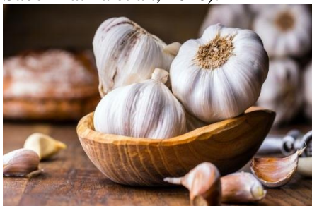
Fig. 4: Garlic

Garlic: Garlic has pharmaceutical effects Figure-4 and used to cure vast conditions including blood pressure and cholesterol, hepatoprotective, anthelmintics, anti-inflammatory (Tesfaye & Mengesha, 2015), antioxidant, antifungal and wound healing, asthma, arthritis, sciatica, lumbago, backache (El-Saber Batiha et al., 2020), bronchitis, chronic fever, tuberculosis, rhinitis, malaria, obstinate skin fistula (Tesfaye & Mengesha, 2015). Frost says garlic is a potent anti-microbial herb, especially in the gut. It is believed to be antiprotozoal, antibacterial, and antiviral. These properties can help fight chest infections and respiratory infections (Motlagh et al., 2020). properties, including anticarcinogenic, antioxidant, antidiabetic, renoprotective, anti-atherosclerotic, antibacterial, antifungal, and anti-hypertensive activities in traditional medicines (El-Saber Batiha et al., 2020).