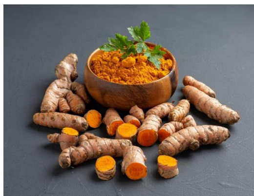
Fig. 3: Turmeric

Turmeric: Turmeric a wide range of biological activities (Lal, 2012) (Figure 3) and is used in traditional medicines and is one of the components of herbal medicine (Lal, 2012). The Western world has consumed turmeric in tablet form (Silva & Fernandes Júnior, 2010). It is locally consumed as a popular spice added to foods in India (Abdel Rahman et al., 2020). Often used to treat muscle pain or even as first aid in an injury. Turmeric contains many ingredients that can help fight disease (Amalraj et al., 2017). The essential oil inhibits the growth of various bacteria, parasites, and pathogenic fungi (Verma et al., 2018). Turmeric's protective effects on the cardiovascular system include lower cholesterol and inhibiting platelet aggregation (Verma et al., 2018) and Constituents of turmeric affects Alzheimer's disease. Extract of turmeric suppresses symptoms associated with arthritis (Sikha & Harini, 2015) and its extract inhibit angiogenesis constituents can induce radio protection constituents to stimulate muscle regeneration (Andrade et al., 2018). Turmeric enhances wound healing and protects against pancreatitis (Mncwangi et al., 2012).